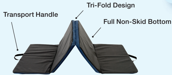
(Underside View of the Mat)