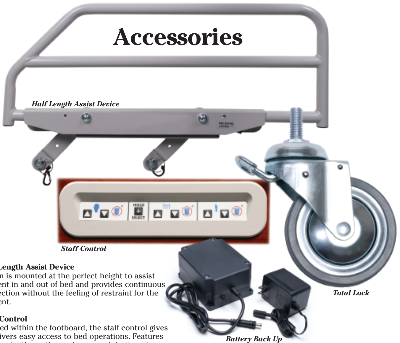
Half Length Assist Device